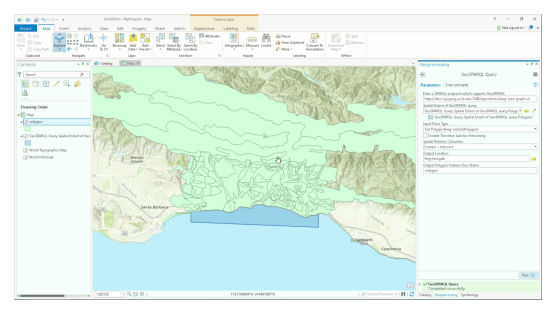
(a) Retrieving soil polygons