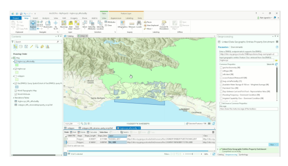
(b) Retrieve wildfires that affected soil polygons