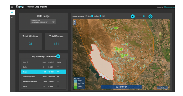
Figure 5. : Wildfire crop impacts interface displaying a smoke plume (yellow shape) from July 4, 2018 associated with the County Fire (red outlined shape). Within this plume we have queried for areas with high densities of grapes to identify areas where the crop may be affected by smoke taint.

to ensure key stakeholders throughout the supply chain are ready with backup strategies to keep products moving. It also allows farmers and growers to identify how they can be better prepared to mitigate and build resilience in the face of such events. Currently, our graph serves pre-integrated data about wildfires, smoke plumes, and crop locations, together with topological information about the affected areas. In one implementation for FMI, a custom front-end web interface (Figure 5) and API enables decision-makers to process a series of queries important to assessing the impact of ongoing wildfires, smoke plumes, and ashes on key food (crop) supply chains. Users can progress through these queries without any experience in using complex GIS software or the specific data and analysis techniques necessary, seeing visualizations of the results at each step. Despite the simplicity of this system, the interface is dynamically generating SPARQL queries based on the user inputs (e.g., defining a region of interest, selecting multiple crop types), sending these queries to the graph via an API and receiving/displaying the results, all within a matter of seconds. This system highlights the ease with which new bespoke end-user applications can be developed from the core resources of the KnowWhereGraph, enabling a multitude of use cases at the human-environment interface.