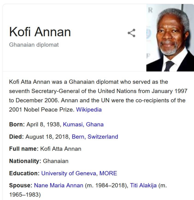
Figure 2: Google Knowledge Graph node – as shown after searching on google.com for the term Kofi Annan .

of data for reuse as one its goals, which means that linked data is mostly made freely available for download or by SPARQL endpoint, and the use of non-restricting licenses is considered of importance in the community. Wikidata as a knowledge graph is also unowned, and open. In contrast, the more recent activities around knowledge graphs are often industry-led, and the prime showcases are not really open in this sense [27].