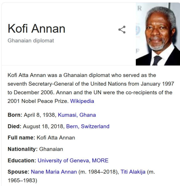
Figure 2: Google Knowledge Graph node – as shown after searching on google.com for the term Kofi Annan .

of data for reuse as one its goals, which means that linked data is mostly made freely available for download or by SPARQL endpoint, and the use of non-restricting licenses is considered of importance in the community. Wikidata as a knowledge graph is also unowned, and open. In contrast, the more recent activities around knowledge graphs are often industry-led, and the prime showcases are not really open in this sense [27].